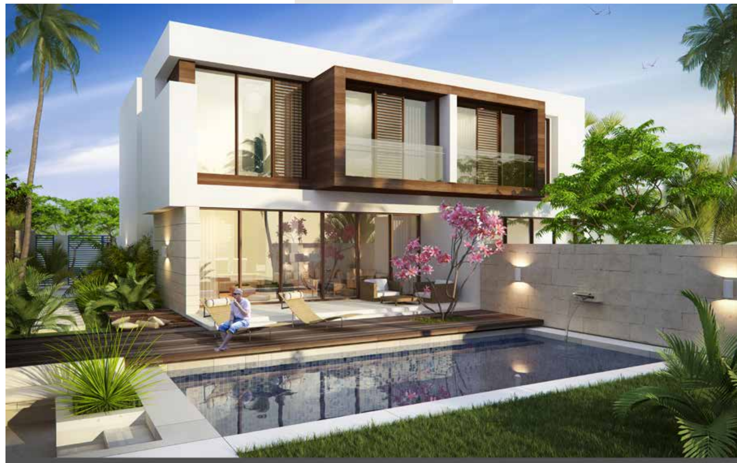
TH-L-A / TH-L

Disclaimer: All pictures, plans, layouts, information, data and details included in this brochure are indicative only and may change at any time up to the final 'as built' status in accordance with final designs of the project, regulatory approvals and planning permissions.