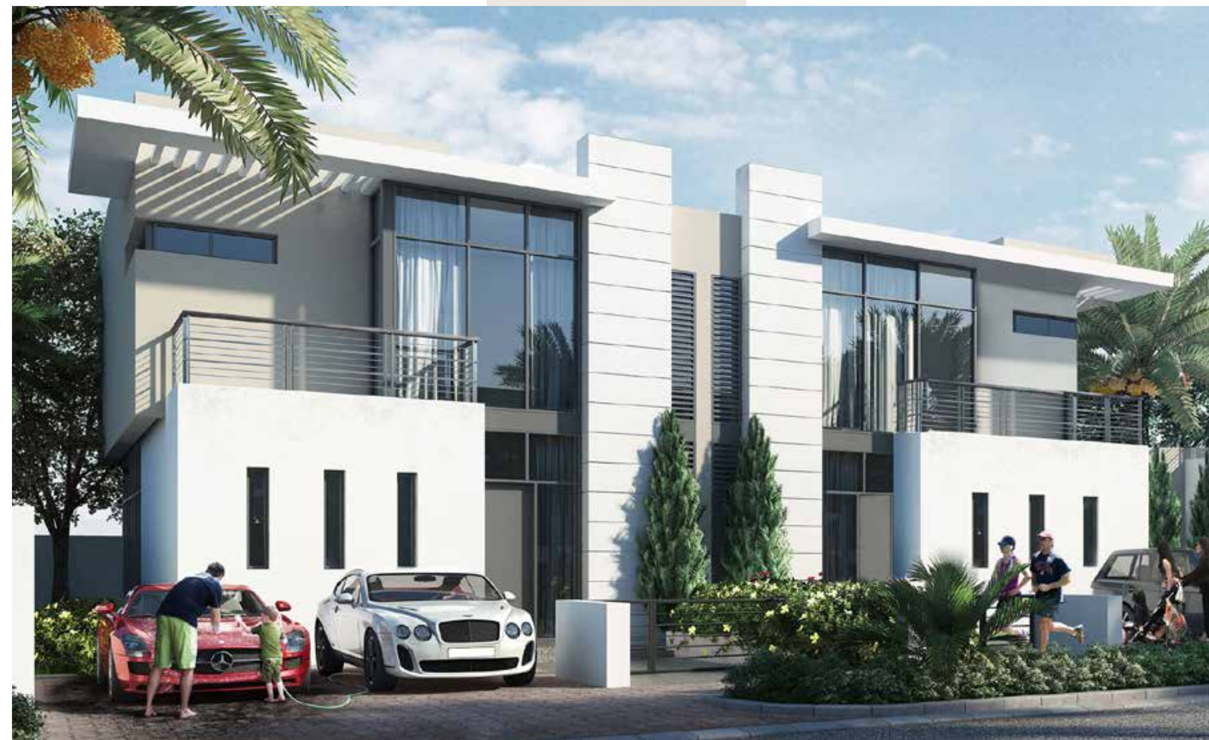
TH-M / TH-M-D

Disclaimer: All pictures, plans, layouts, information, data and details included in this brochure are indicative only and may change at any time up to the final 'as built' status in accordance with final designs of the project, regulatory approvals and planning permissions.